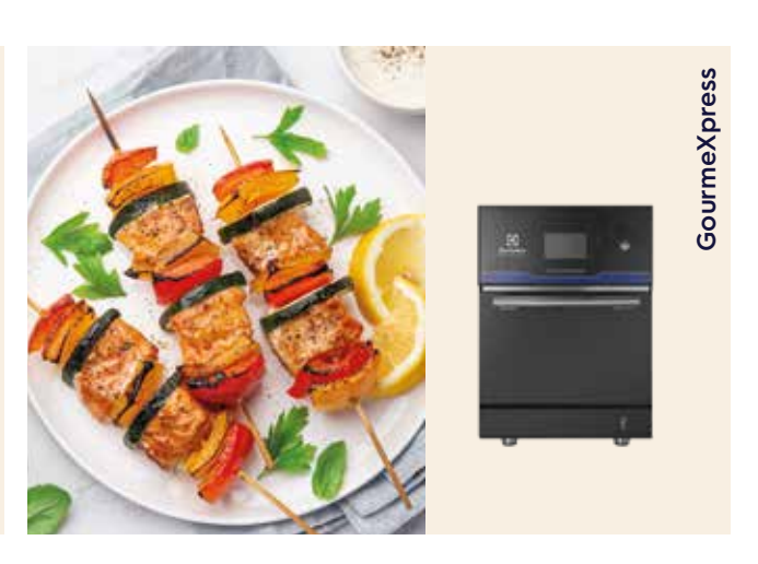
GourmeXpress The High Speed experience for complete meals.*